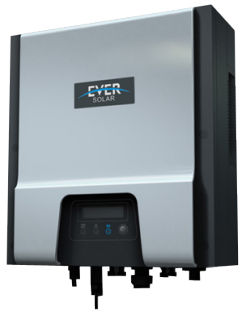
Eversolar inverter 5 years warranty