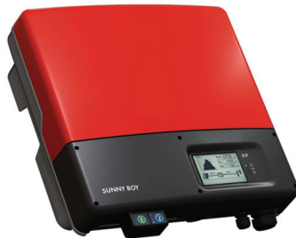
SMA Sunny Boy inverter 5 years warranty