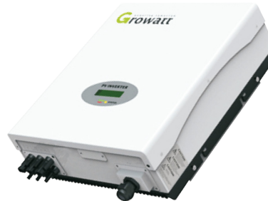
Growatt Sungold inverter 5 years warranty